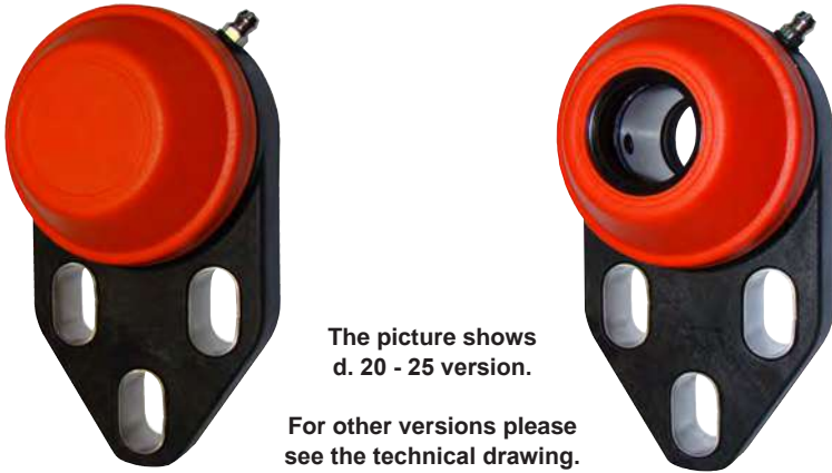
The picture shows d. 20 - 25 version.

For other versions please see the technical drawing.